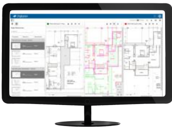
Quickly and easily spot hard to see differences in subsequent review cycle

DigEplan support the management of plans at a sheet level, removing the need to force applicants to resubmit entire plan sets at each cycle, or requiring plans to be split on upload, which is complicated and cumbersome.