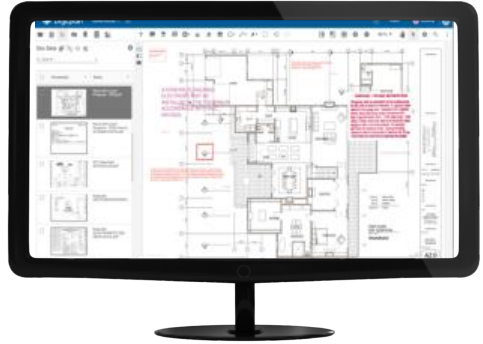
DigEplan enables users to work with electronic plan review cycles from within Amanda

DigEplan for Amanda provides a rich set of engineering grade annotation features that allow reviewers to communicate, comment and add in-context observations and instructions, directly within plans and supporting plan documents.